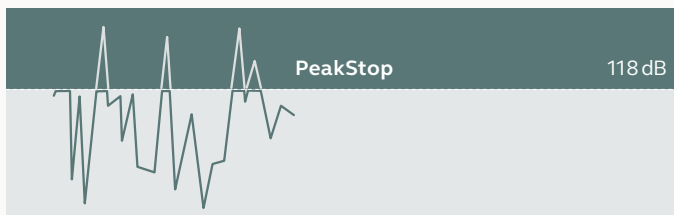
Fig. 2: PeakStop continuously monitors the sound flow and actively reduces critical sound peaks to a safe level.

All Jabra headsets come with PeakStop technology that eliminates potentially harmful sound spikes. Based on an electronic gateway or transistor that reacts instantly, PeakStop actively protects the user by keeping the absolute sound level and the energy of the peak in the safe zone at all times, thus preventing potentially harmful sound from reaching the ear.