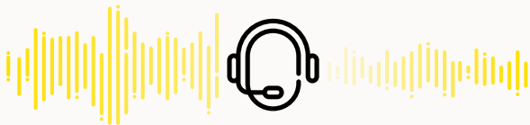
Fig. 5: Speaker software powers all incoming calls to the sound level preferred by the user

Research shows that users often turn up the volume for a quieter incoming call, and forget to turn it down again, thereby being exposed to unnecessary high volumes, which can potentially damage the hearing. Speech level normalization protects your hearing by ensuring that every call is initiated at the preferred sound level.